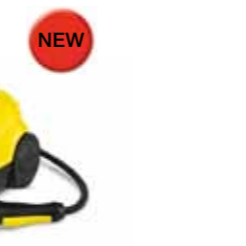
SC 1.030 B