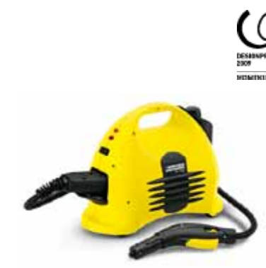
SC 1125 Plus